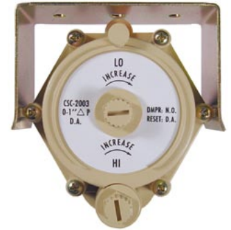
Without Molded Dial