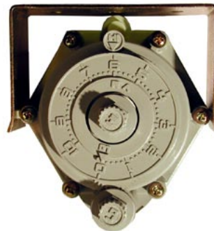
With 0–10 Molded Plastic Dial (Mount with Face Up Only)

Each is equipped with separate adjustment knobs for minimum and maximum airflow settings. All models should be calibrated with the use of airflow measuring equipment.